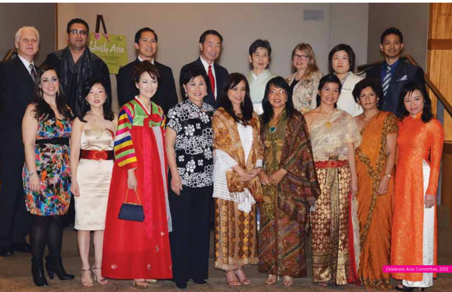
Celebrate Asia Committee, 2012