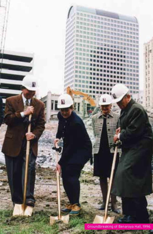
Groundbreaking of Benaroya Hall, 1996