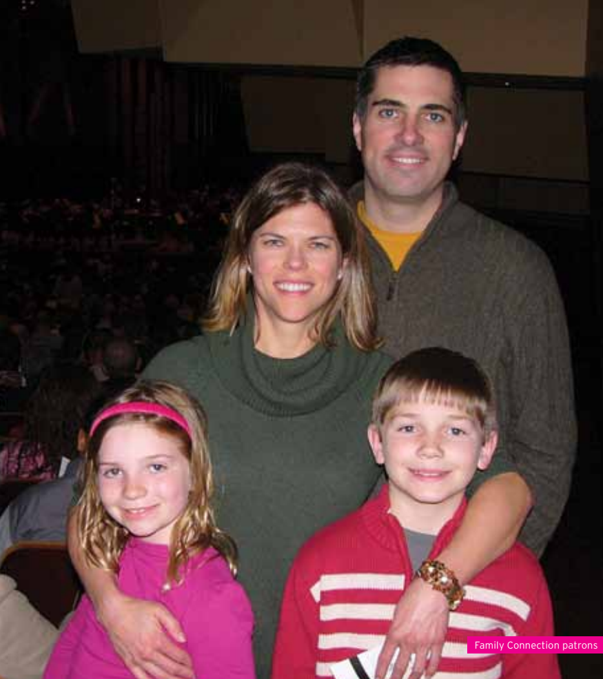
Family Connection patrons