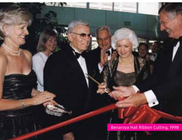
Benaroya Hall Ribbon Cutting, 1998