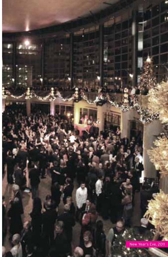
New Year's Eve, 2011