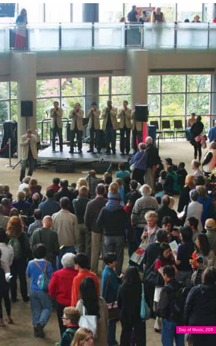
Day of Music, 2011