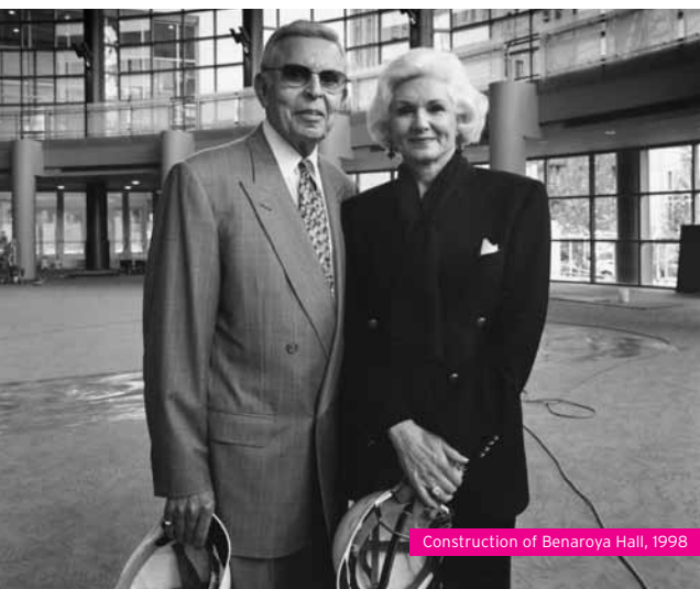
Construction of Benaroya Hall, 1998