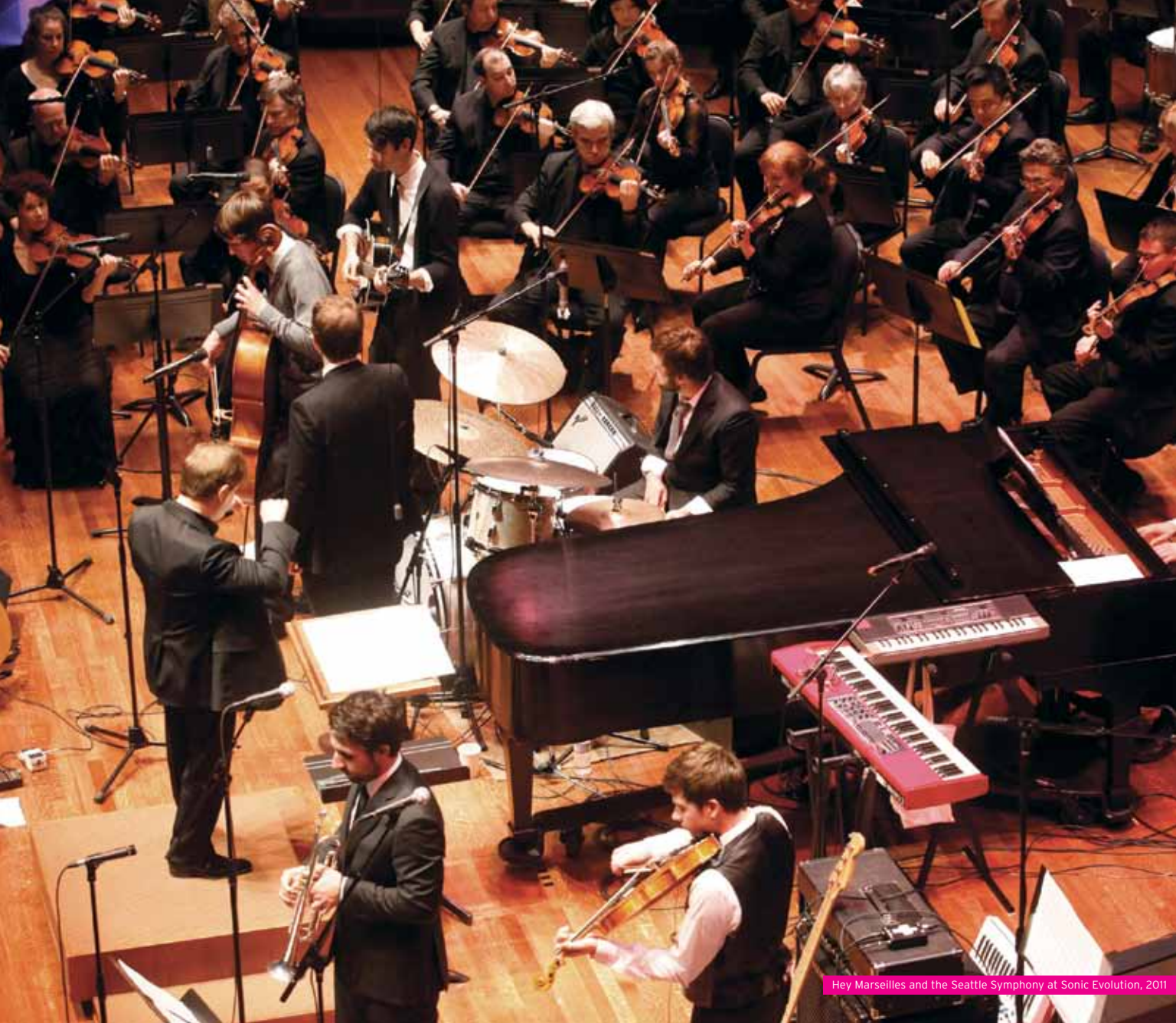
Hey Marseilles and the Seattle Symphony at Sonic Evolution, 2011