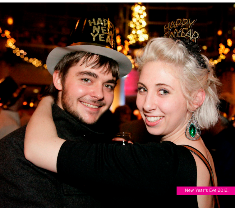
New Year's Eve 2012.