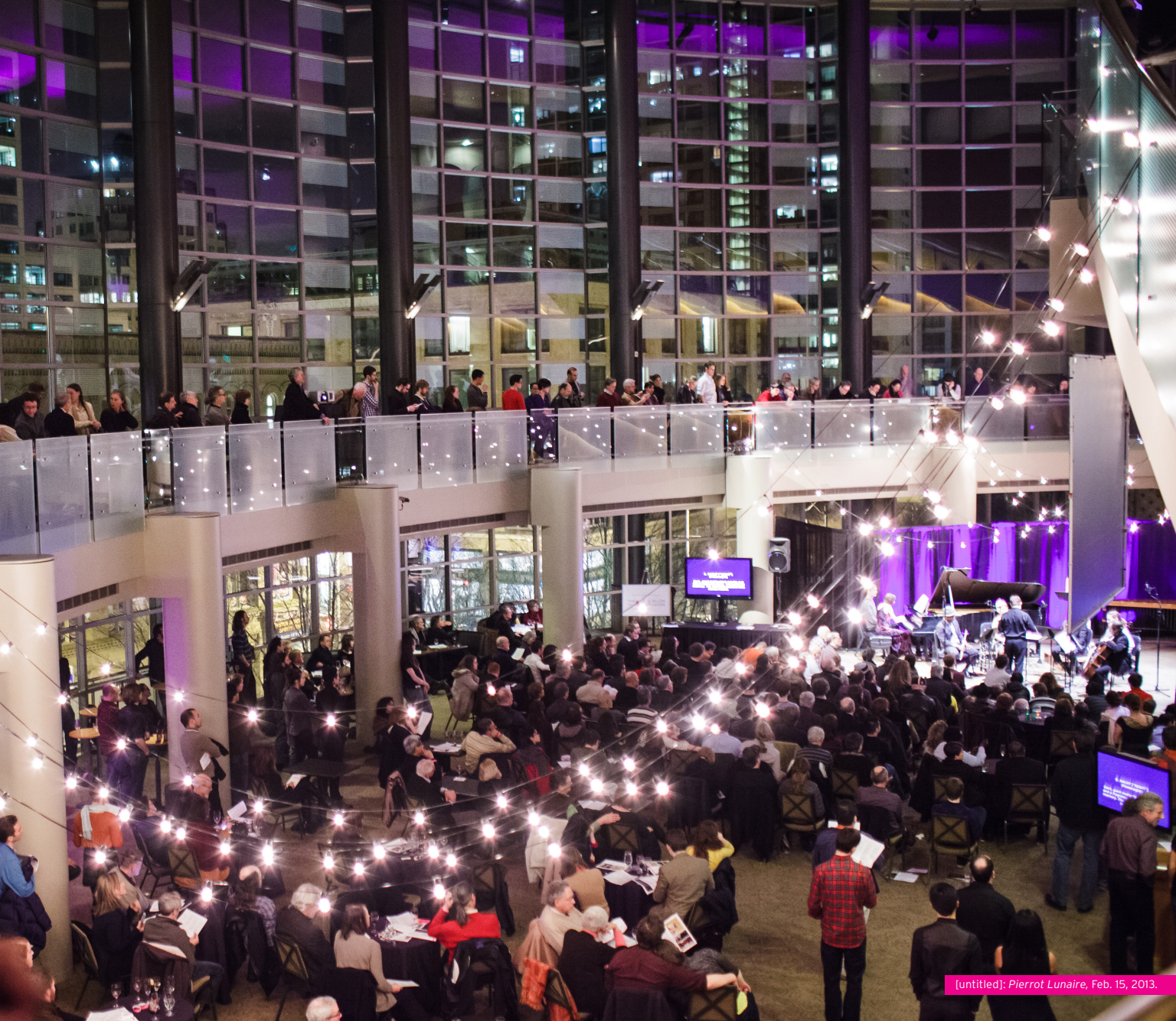
[untitled]: Pierrot Luneire, Feb. 15, 2013.