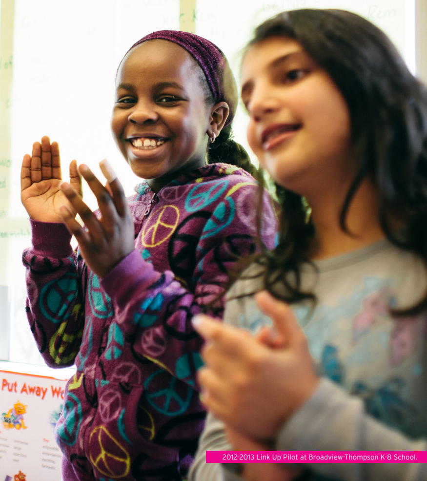
2012-2013 Link Up Pilot at Broadview-Thompson K-8 School.