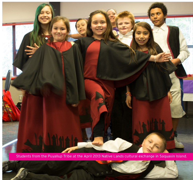
Students from the Puyallup Tribe at the April 2013 Native Lands cultural exchange in Saquaxin Island.