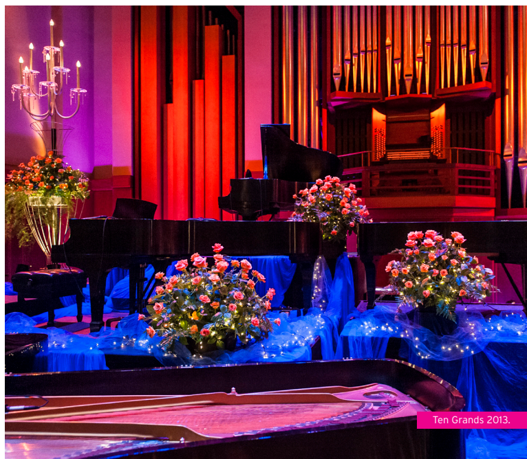
Ten Grands 2013.